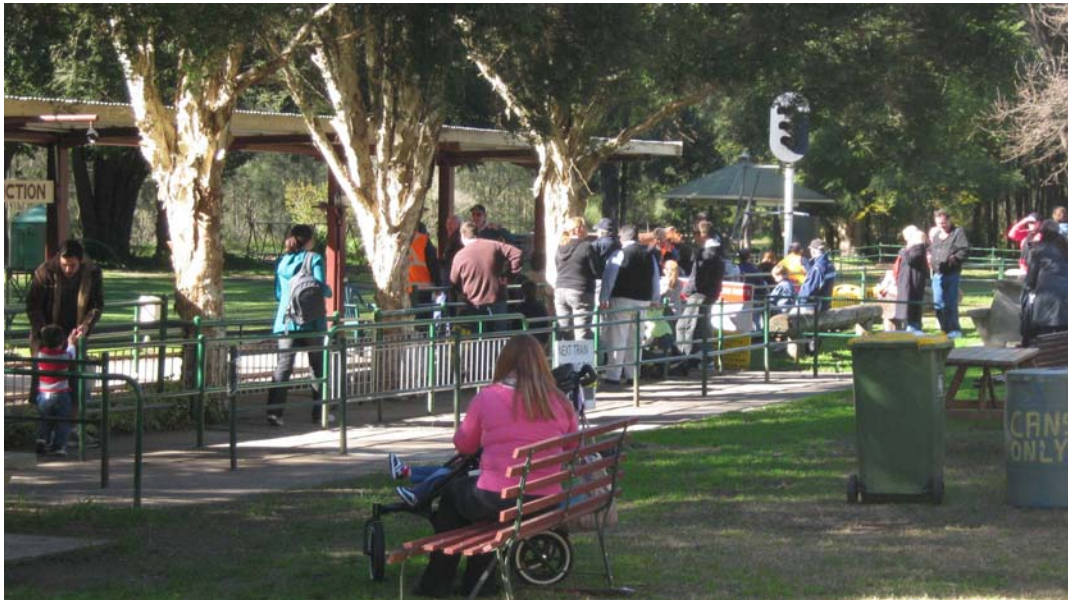
Our Club Grounds at the July Public Running Day Sat 3 rd July 2010.

All in all, despite the cold weather, the grounds are looking marvellous. The lawns are still growing and always in need of mowing.