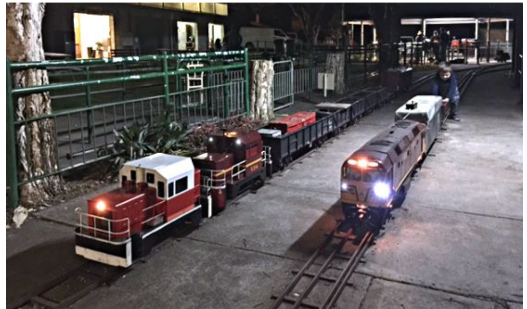
David Kirklands' 422 and Leal's X200 at Station Birthday Night 1 August 2015

Showground Road, Narara (opp. Bellbowrie Ave)